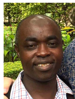
some of our Kenyan students